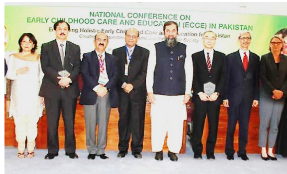
Government officials and participants at the conference