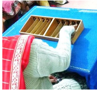
The Spindle Boxes