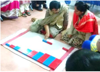
Counting the number rods