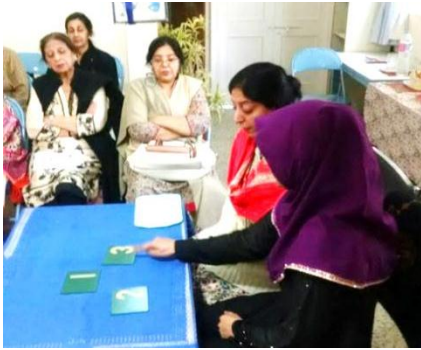
Three period lesson with the sandpaper numbers