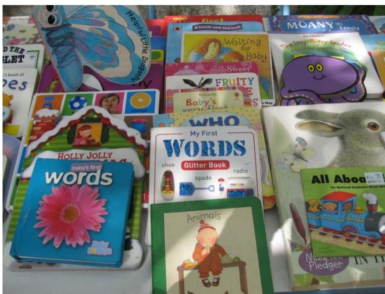
A display of books at the Book Fair at PMA